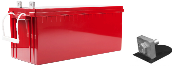
LT - Lug Terminal