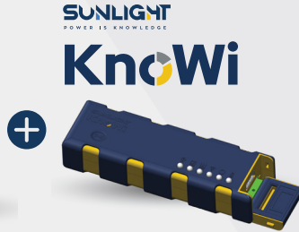
BMS data capture & upload in GLocal