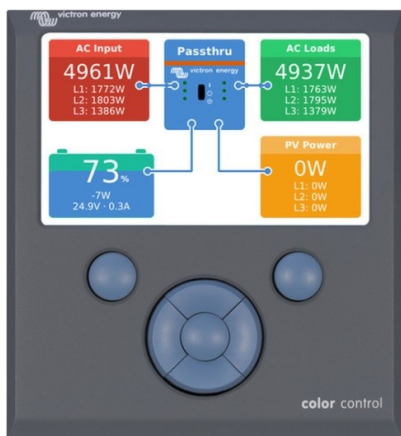
Color Control Panel, showing a PV application

When connected to the Ethernet, systems with a Color Control panel can be accessed remotely and settings can be changed.