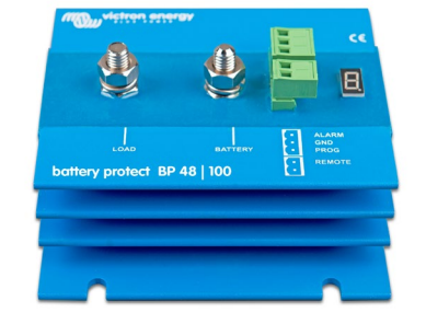
BatteryProtect BP 48-100